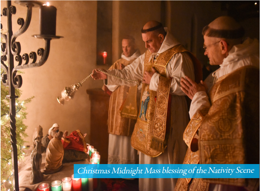
Christmas Midnight Mass blessing of the Nativity Scene

T ODAY WE ARE SCANDALIZED – yes, truly scandalized – by the situation in the Church. We thought that the Church was truly divine and that she could never be wrong, that she could never deceive us ... Yes, it's true, the Church is divine. The Church cannot lose the truth ; the Church will always keep the Eternal Truth, yet she is human. The Church is human and much more human than Our Lord Jesus Christ. Our Lord could never sin: He was the Holy One, the Just One par excellence. The Church is divine and truly divine, she brings us all the things of God and most especially the Holy Eucharist ; eternal things that can never change, which procure the glory of our souls in Heaven. Yes, the Church is divine, but she is also human. She is supported by men who might be sinners, or who are indeed sinful, and who, if they participate in a certain manner in the divinity of the Church, to a certain extent (like the Pope, for example, who by the charism of infallibility participates in the divinity of the Church), nevertheless remain men and remain sinners. Apart from the cases in which the Pope uses his charism of infallibility, he can err and can sin. So why should we be scandalized and say, just like Arius: “He is not Pope! He's not a pope?”