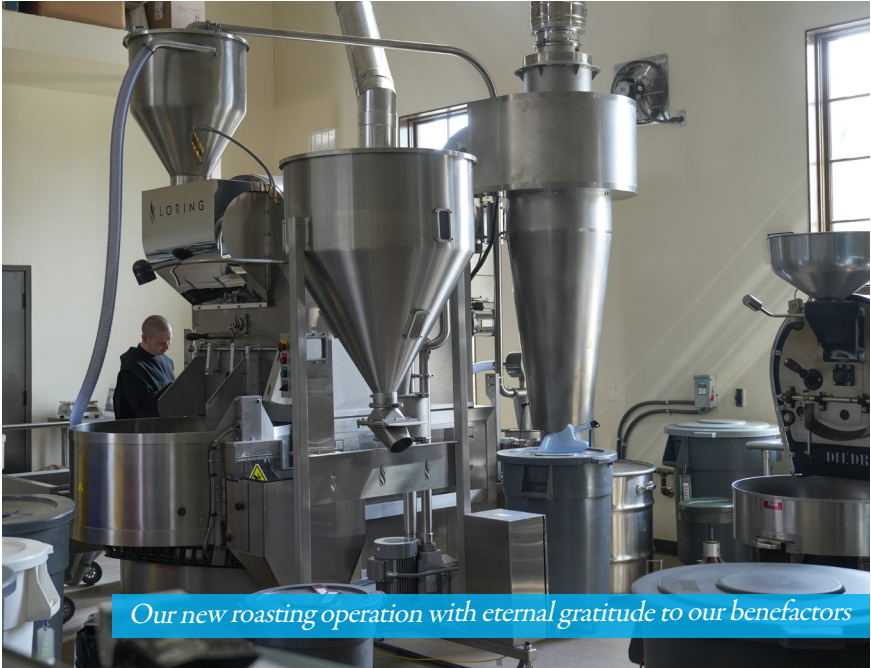
Our new roasting operation with eternal gratitude to our benefactors

successor of Peter, because it is through him that we are united to Our Lord Jesus Christ, through the Bishop of Rome, successor of Peter. But if unfortunately, driven by I don't know what spirit or what formation, or what pressure he is under, by negligence, he leaves us and leads us on paths that make us lose our Faith. Well no, we must not follow him, while nevertheless recognizing that he is Peter and that if he speaks with the charism of infallibility, we must accept it. But when he does not speak with the charism of infallibility, he may very well be mistaken.