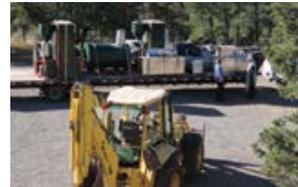
November 5th, A truckload of coffee roasting equipment arrives, donated by benefactors.

With a crowd of pilgrims numbering nearly 12,000, representing countries of every continent, Christ the King was specially honored in Lourdes throughout three days of fervent pilgrimage, the likes of which has not been seen since before the Council. The processions of Clergy, Religious and Faithful, both within the shrine and throughout the city stretched over one mile, by candle-lit night as well as by day. The traditional solemn blessing of the sick brought by the hospital Religious and families was a moving spectacle.