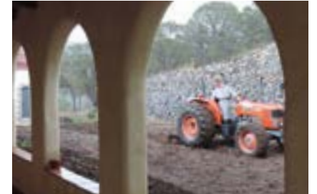
Our orchard is prepared for selected fruit trees which can survive at high altitude.