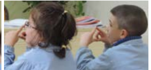
The monastic sign for God.