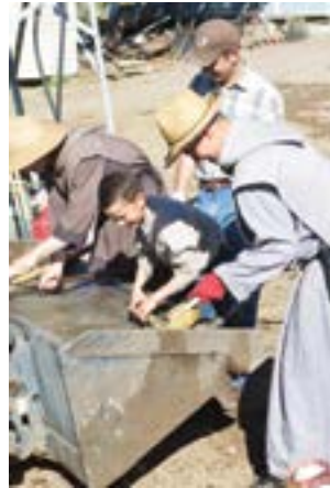
As more trucks arrive, monks and volunteers work together to finish pouring the concrete foundations for several new buildings.